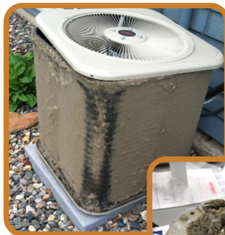
Dirty Central Air Conditioner